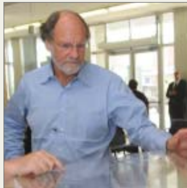
Gov. Jon Corzine (D-NJ) examines the model of the Sarah Wetsman Davidson Tower.