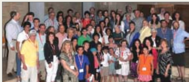
Hadassah Renaissance Mission 42