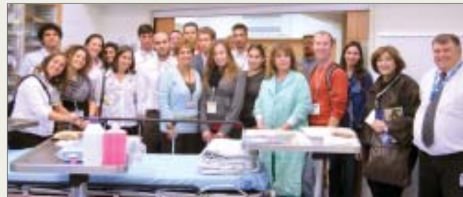
United Jewish Communities "Next Generation" Delegation