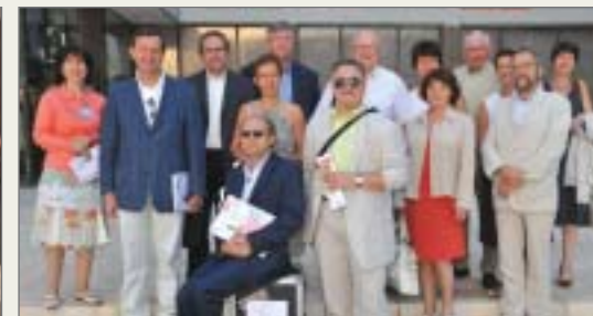
Healthcare Officials from France