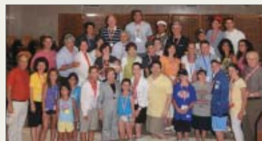
Great Neck NY Family Mission