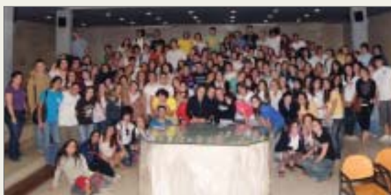
Young Judaea Year Course