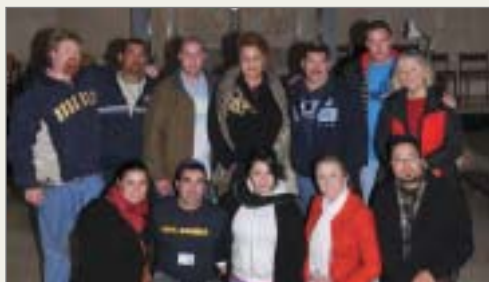
Los Angeles CA Federation Holy Land Democracy Project