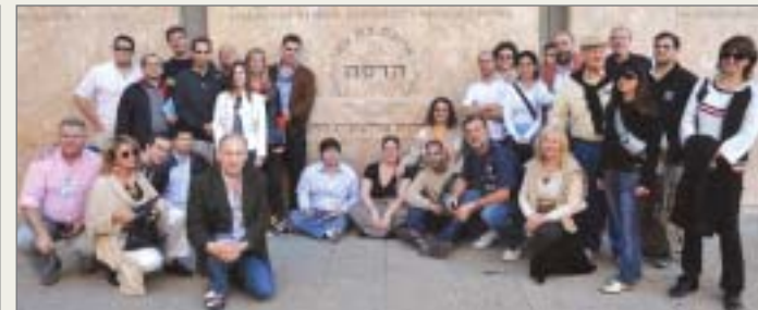
Tesa Foundation of Argentina