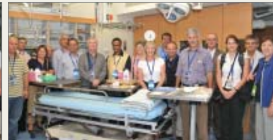
American mayors at the 26th Jerusalem International Conference of Mayors