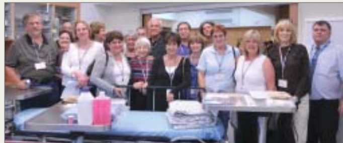
UJC Minneapolis MN Mission