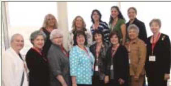
Hadassah Region and Big Chapter Presidents