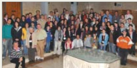
Young Judeaea Family Mission