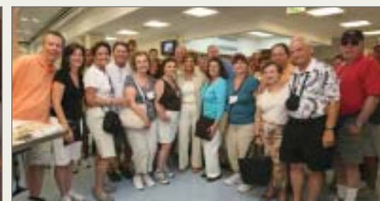
Congregation Beth Yeshurun, Houston TX