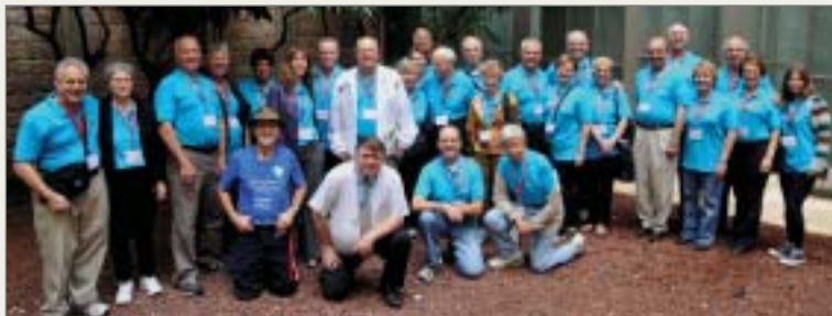
Hadassah Associates Mission