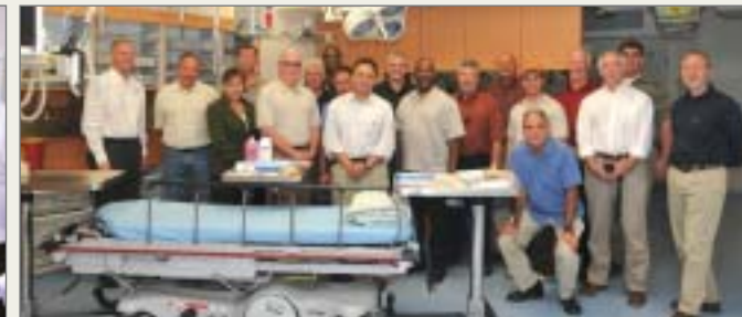
AIPAC Fire Chiefs' Mission