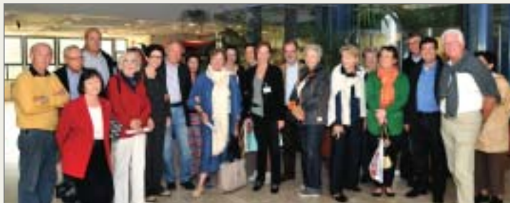
Delegation from Austria