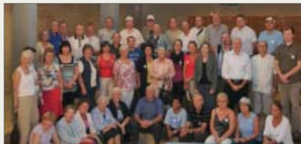
Help the Jews Home