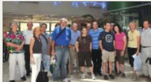
Greater Salt Lake City UT Mission