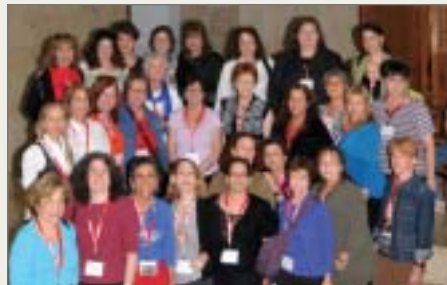
Hadassah Quest Mission