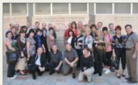
Los Angeles CA Valley Mission