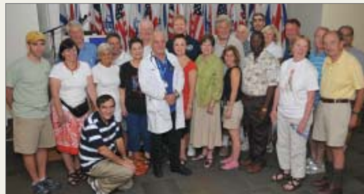
Virginia State Senators, Delegates and community leaders in a visit sponsored by the Greater Washington Jewish Community Relations Council.