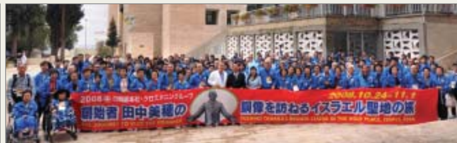
Delegation from Nikken, Inc., a Japanese wellness company